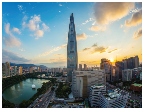
Seoul (KOREA) • December 7-8