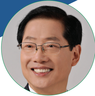
HON. JAE SAE OH KOREAN NATIONAL ASSEMBLY Minjoo Party

READ FULL SPEAKERS' BIOS ONLINE AT: 1DREAM1KOREA.INFO/FORUM