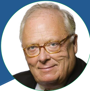
DR. EDWIN J. FEULNER

FOUNDER AND PRESIDENT The Heritage Foundation