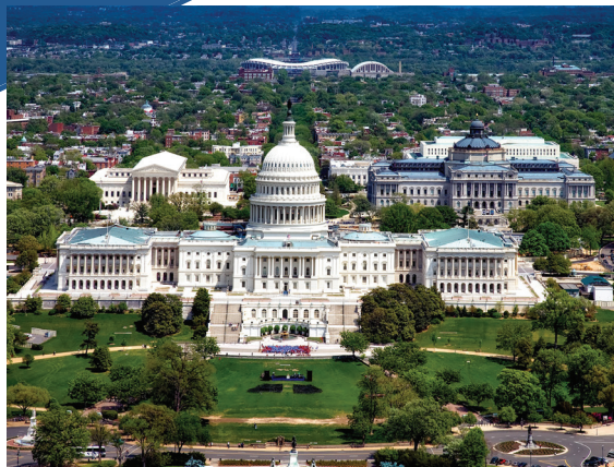
Washington, D.C. (USA) • November 14-15