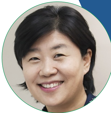
HON. YOUNG KYO SEO KOREAN NATIONAL ASSEMBLY Minjoo Party