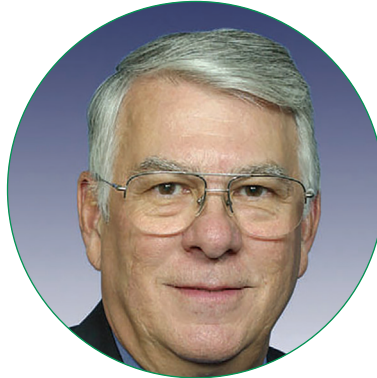
FORMER CONGRESSMAN DONALD MANZULLO

PRESIDENT & CEO Korea Economic Institute of America