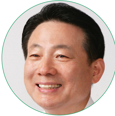
HON. CHAN WOO PARK KOREAN NATIONAL ASSEMBLY Korea Liberty Party