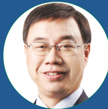
HON. SANG JIN SHIN KOREAN NATIONAL ASSEMBLY Korea Liberty Party