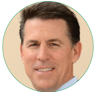
REV. DR. ROBERT SCHULLER CO-CHAIRMAN Coalition for American Renewal